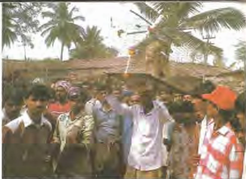
The Fox being carried in procession, without ornaments!