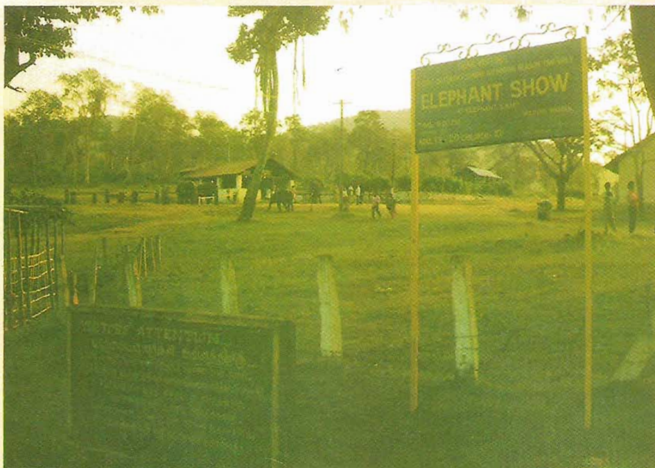
A view of the 'Elephant Show' Paddock

match is also organised between two elephant teams for which the mahouts mounted on elephants make the pachyderms kick a ball. However, the most shocking is seeing these elephants, living within a sanctuary, being made to sit on pedestals and