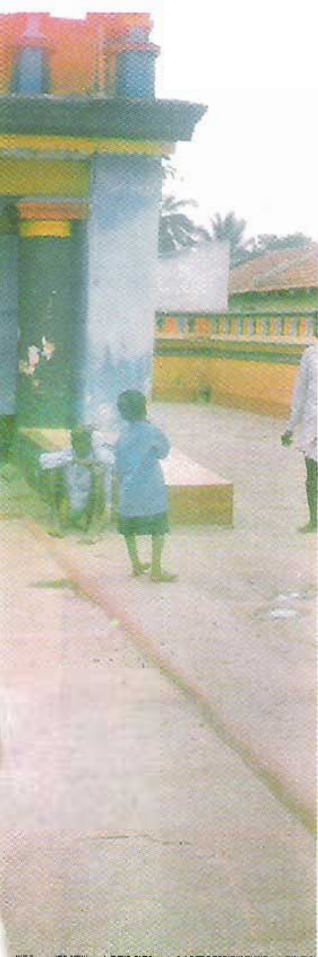
The Altar saw no blood this year