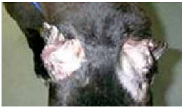
View from the top of its head.

Greyhounds are made to travel long distances in severe weather, regardless of the facts that they are sensitive to heat and lack the ability to sweat. Accidents are common while racing, and the injured are killed. On numerous occasions, they have eventually been sold to laboratories for testing or research.