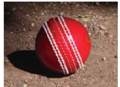
Non-leather cricket balls enjoying higher sales.

Today, non-leather cricket balls enjoy higher sales than those made of leather, mainly because they are cheaper and slower to wear out. Usually made of Poly Vinyl Chloride (PVC) on the outside with Poly Urethane (PU) cores, their performance may not be perfect — but then how many youngsters play world-class cricket?