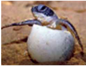
Olive Ridley turtle hatching into a wild world.

There are seven turtle species, one of them being the Olive Ridley. One of the world's