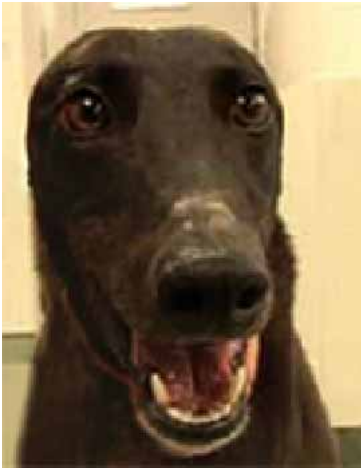
An abandoned greyhound, ears severed to get rid of its mandatory identification tattoo.