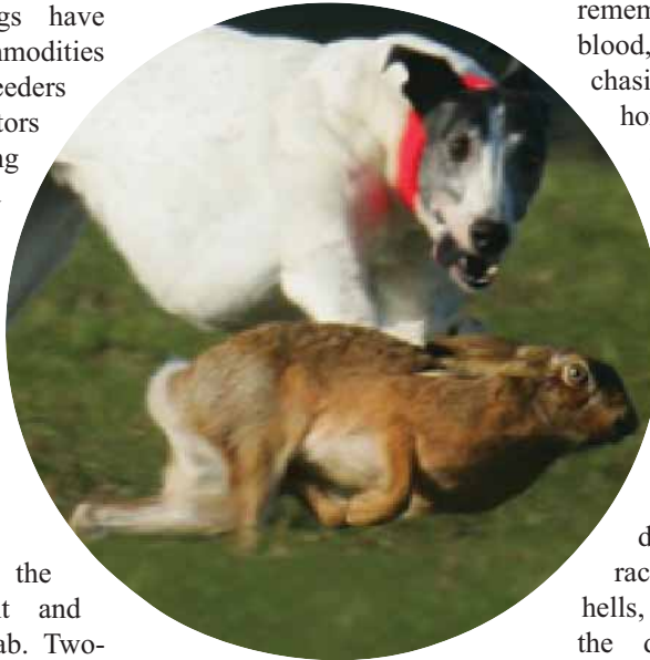
This hare, literally running for its life, was torn apart by the hungry greyhound.

(or let out of a box) and the greyhounds are released to chase it. There is a judge who awards points to each greyhound according to how well it pursues the hare. The object isn't to kill the hare and, in some coursing events (e.g. in Ireland), the greyhounds are muzzled. The hare is, however, often caught and killed in a horrific fashion, and terrified even if not caught.