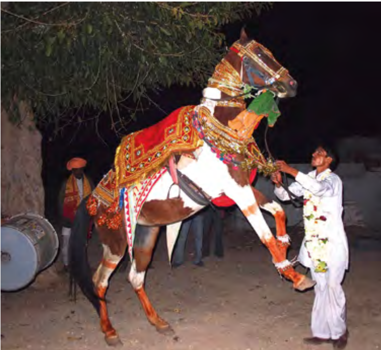
An unhappy decked up horse.

Last year a mare called Payal had been booked to carry a groom in a wedding procession at Mumbai, but while being taken there, she got frightened by a garbage truck horn (as loud as a fire cracker). She threw off her jockey-caretaker who fractured his leg and looked on helplessly while she bolted... she entered the toll naka and ran alongside the cars almost the entire length of the Bandra Worli Sea Link... eliciting smiles, chaos and a slowdown of cars. Eventually, some Israeli tourists who knew how to handle horses got off their taxi and reined her in. It then came to light that a few months ago the owner had bought the 4-year old ghodi costing ₹ 1 lakh, but on a down payment of ₹ 25,000/- from a rural fair in Solapur. He said that she could dance, had also acted in the TV serial Maharana Pratap and appeared in newspaper advertisements.