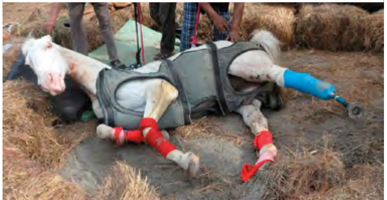
Would a Policeman on duty have been thrashed like this Police horse? Since it was feared that with an artificial limb, the horse would never be able to walk normally again, out of pity an American flew in with a prosthetic leg and shoe for the poor horse. A couple of days later, unfortunately Shaktimaan did not wake up after being administered anesthesia for "a minor surgery".

The Delhi Mounted Police's 40 stallions (most under 2 years) ensure law and order. For example, 2 were on duty at the Ferozeshah Kotla Stadium in December 2015 during the India-South Africa cricket match. But, they had to be cautiously taken to the location because horses get into a frenzy by the honking of vehicles.