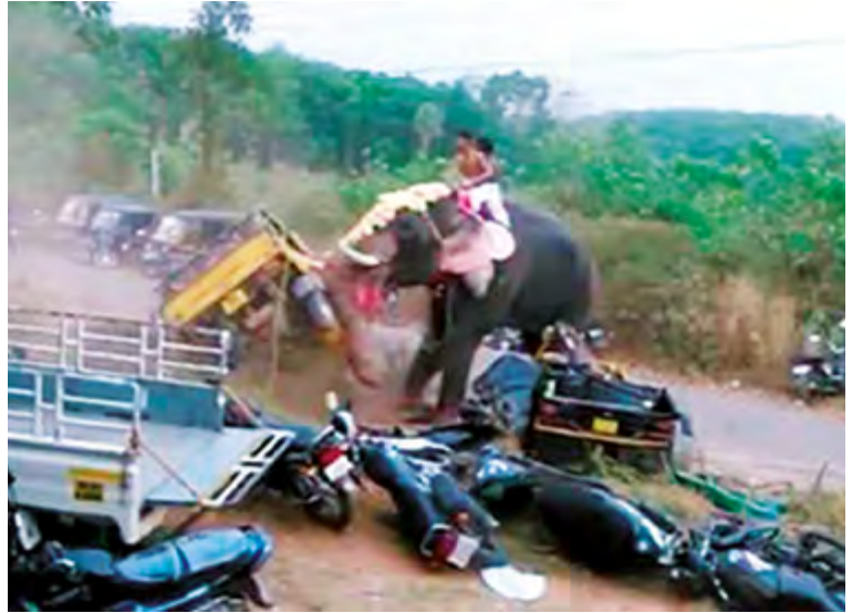
Elephant rage. Justified retaliation.

Processions involving animals require Police permission. Crackers are burst and blaring music is played all along the route which more often than not scares the