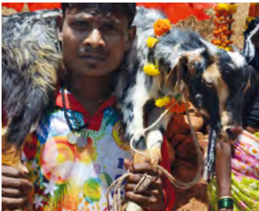
Trudging up the hill to the temple with a goat that was brought down the same way and sacrificed.