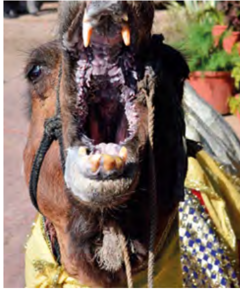
The angry camel of Ahmedabad.

If tourists were wise about their own safety and had compassion for animals, they would not ride elephants, camels or ponies. In January 2015 a man in Ahmedabad was killed by a camel that bit