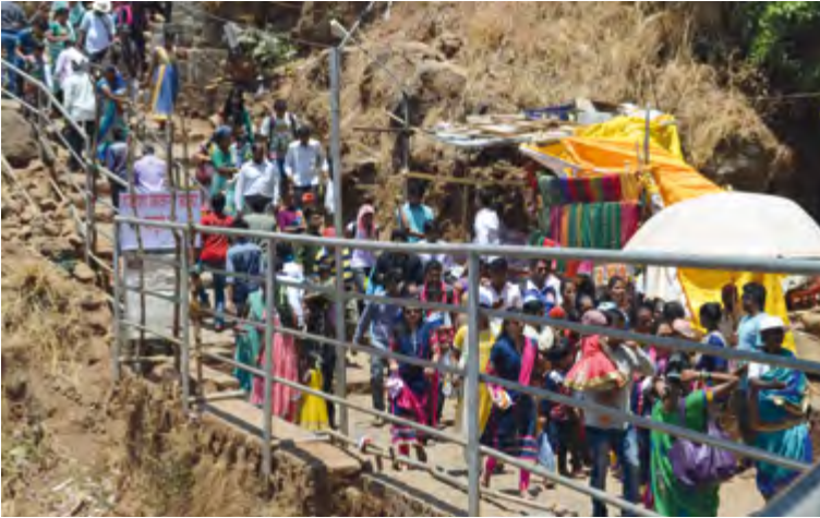
This year the majority of devotees walked up the hill to the Ekvira Devi temple and paid their respects without killing an animal or bird.

Significantly, a twenty-six member team of VPKM supported by many institutions and individuals, worked tirelessly in Chamrajanagar, Mandya and Mysuru districts to create awareness among people through the Ahimsa Prani Daya Sandesh Yatra .