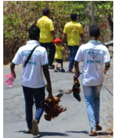
These chickens were carried upside down up the hill into the temple, blessed and brought back down, only to be sacrificed.

Remember, there are no restrictions imposed on BWC members: we accept non-vegetarians, vegetarians and vegans.