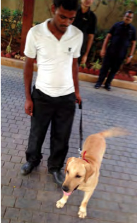
Sniffer dog with handler at Hotel JW Marriott, Mumbai.

complain that they are overworked. These dogs are supposedly given the best quality of food, travel in first class air conditioned comfort along with their handlers and are insured like their human counterparts. But all this means nothing to the dogs.