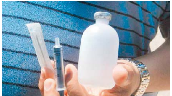
Doodh ki Dawa.

Stop Press: The Drug Technical Advisory Board recommended that the clause banning retail sale of Oxytocin through chemists to "ensure the availability for human use" should be deleted in the Notification. And, since one of the two private producers has challenged the Notification before the Delhi High Court, the misuse which is harmful to animals and humans may not end.