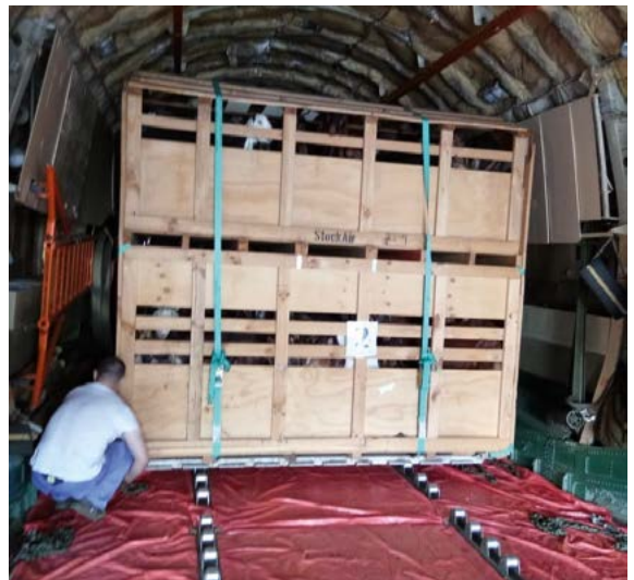
Air cargo of live goats and sheep flown out of India for slaughter.