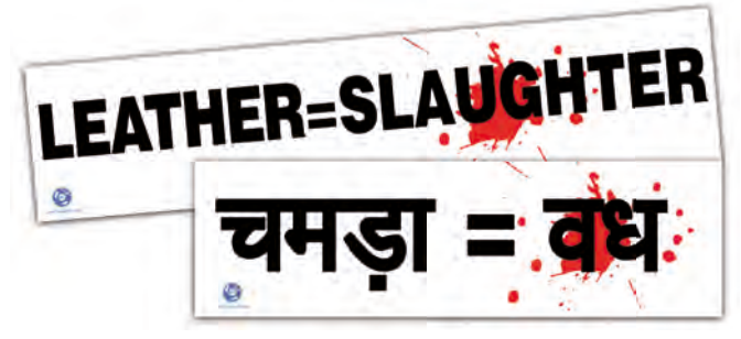
Ask BWC for these car stickers.

In most cases, the name of the animal precedes the words "leather," "skin" or "hide," indicating the creature that was killed to obtain it. And, while most people know, for example,