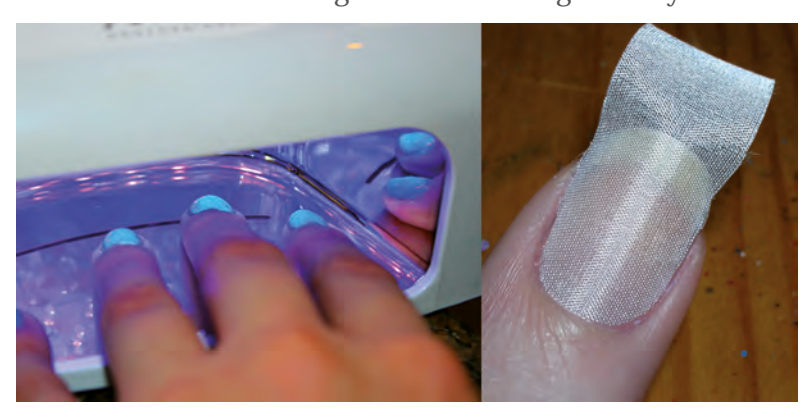
Left: UV Nail dryer. Right: Silk nail wrap ready for shaping.

Shellac and shells are of animal origin, and so are some of the other items used at nail bars. Artificial nail tips or lengtheners made of acrylic are non-animal, but the gels may not be