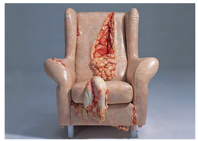
The innards of leather.

No wonder then that, in April 2013, the Council for Leather Exports (CLE) planned shockingly get into organised cattleto abridge the farming shortage of raw leather, the demand for which had resulted in imports doubling to ₹2153.3 crores in 2010-11 over the preceding five years. It blamed the shortage on the illegal movement of live