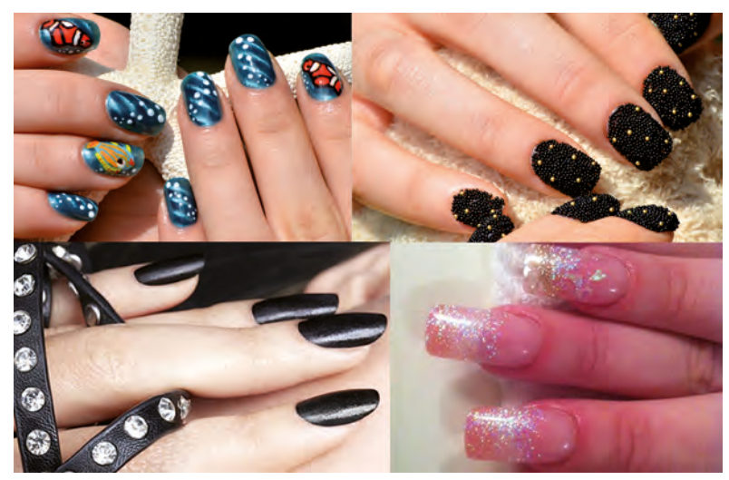
Shellac-painted nails have leather, caviar and crushed shell finishes.

The supplies used are no different from other cosmetic and make-up