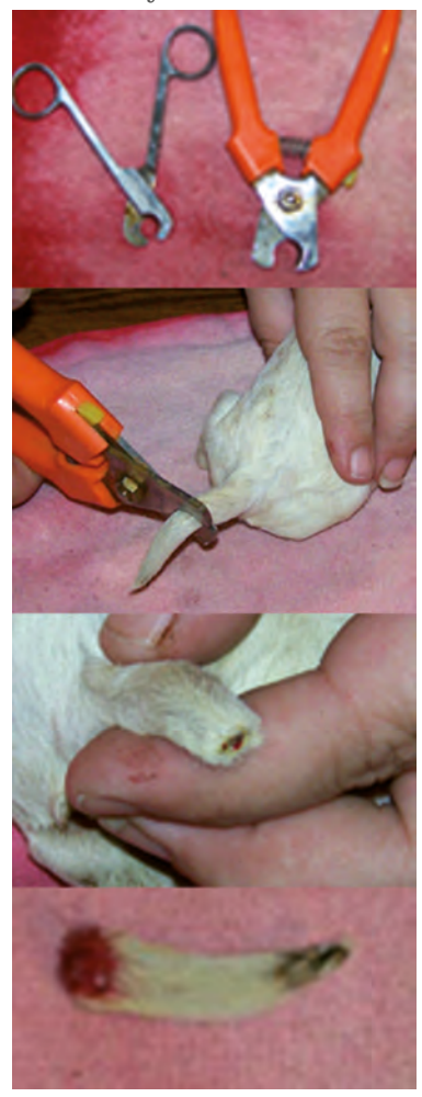
Amputating a dog's tail for the vanity of its 'owner.'

The directive resulted in the Kennel Club of India filing a writ petition in the Madras High Court. In February 2013 the Judge quashed the notice issued by the Veterinary Council (on the