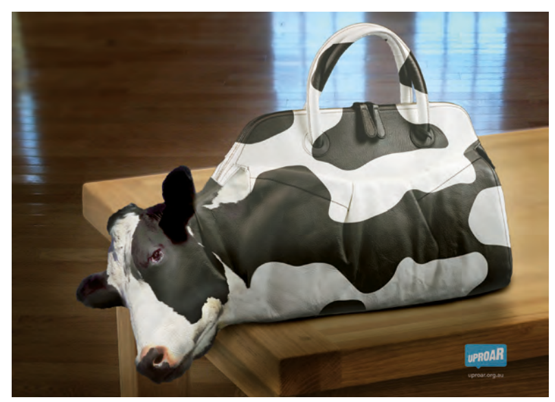
Fashion victim.

that bovine leather is derived from the cow, bull, bullock, ox, steer or heifer, and that reptile skins are from snakes, lizards, crocodiles and alligators, there are certain leathers that do not name the species of animal that lived in those skins not long ago. Some such leathers are tabled overleaf.