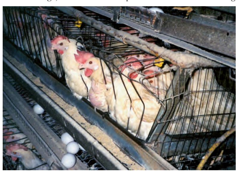
Miserable layers.

Live chickens are no different from other birds. How can humans enjoy birdwatching in the wild, yet love eating chickens, and even feed the latter to their pets?