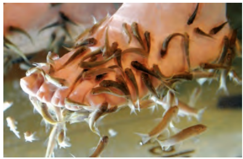
Garra rufa fish pedicure.

so; whereas the silk wrap extensions are positively animal in origin.