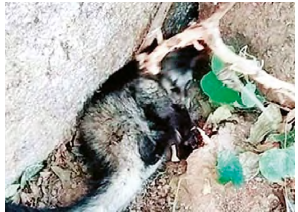
Six Common Palm Civets dead at Nandankanan.

Veterinary failure and lack of resources due to lockdowns will lead to many such unnatural deaths and the present and future pandemics is proving that the zoo business is unsustainable and financially unviable, in the current scenario and in the foreseeable future.