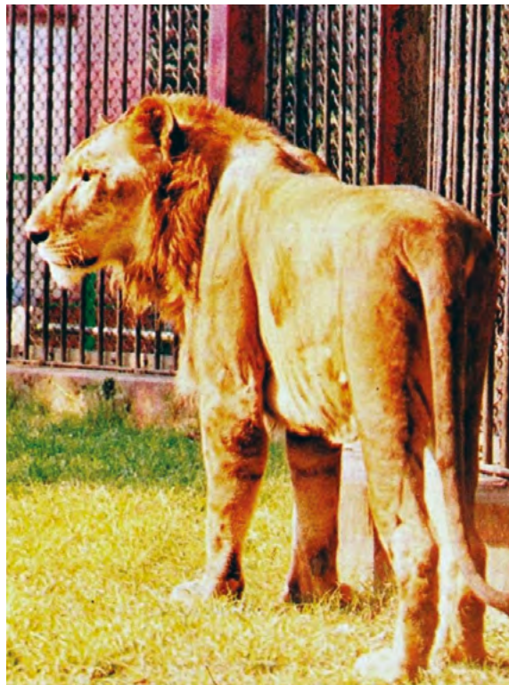
The Litigon named Cubanacan produced as a hybrid of a Lion and a Tigon(Tiger X Lion) in a controversial experiment in Alipore Zoo, Kolkata.

My personal zoo visits across three continents have taught me that Western zoos are NOT better than Indian zoos, although there is an assumption that Indian zoos are worse than Western zoos. A major concern is the continued and unchecked breeding of animals in zoos that lead to a multiplicity of problems like the one witnessed in Delhi Zoo