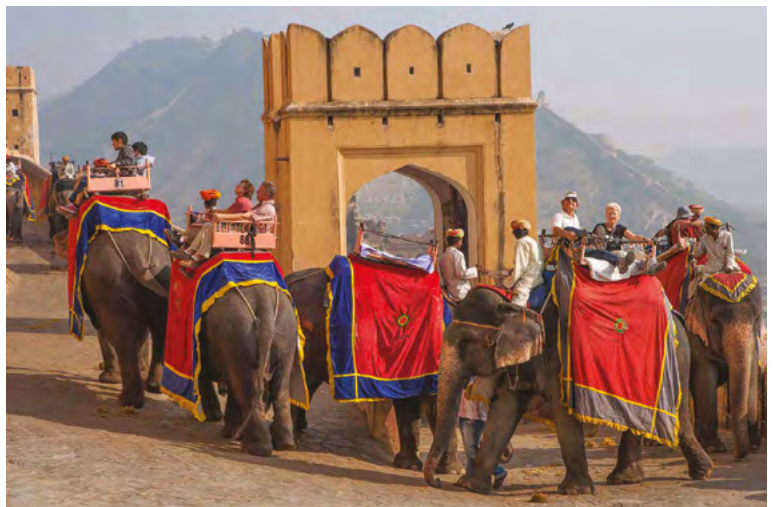
Tourists ride on elephants in Amer Fort, unbeknownst the animals' suffering.

Elephants in captivity under private ownership have borne the worst brunt of the effects of the Covid-19 pandemic. They remain significant susceptible victims for contracting Zoonotic Tuberculosis from infected humans, due to reduced nutrition, lack of veterinary care, constant chaining, lack of exercise and consequent lowering of mental health conditions as well. Disease transmission of zoonotic diseases is and will be the main source of future pandemics and