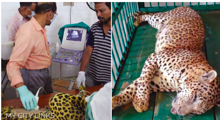
A 16 year old male leopard dies at Nandankanan.

No amount of enrichment, however, can ever make up for loss of freedom! As humans are facing this now and have come up with environmental enrichments in their daily lives like movies, social media, video calls and virtual experiences of travel and socializing,