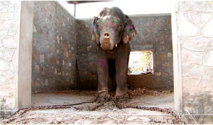
Chained, injured, sick and eventually dead – the plight of elephants in so-called Hathi gaon near Jaipur.

capture and ownership. In India, there are approximately 2675 captive elephants with more than 1800 owned by private individuals. The Covid-19 situation exposed the vulnerability of owners to market forces. Together with the near absence of congregations and the closure of traditional venues where these animals are displayed, ridden, exposed to tourists and paraded, the avenues of income generation was abruptly switched off. Owners today are unable to have their expenditures matching the income and the profit the elephants generated.