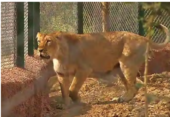
Lioness Rameshwari dies in Bokaro Zoo, Jharkhand in June 2020.

Pandemics like Covid-19 will not be the last to plague the planet. To be mindful of such crisis in the future and to start the phasing out of restrictive, badly maintained and poorly looked after zoos would be the first step in the right direction. Zoos depend on public footfall to survive, and even if there are swarming crowds to zoos or none at all - zoo animals suffer the most.