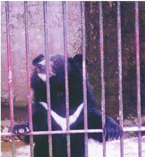
Himalayan Black Bear in Kohima Zoo.